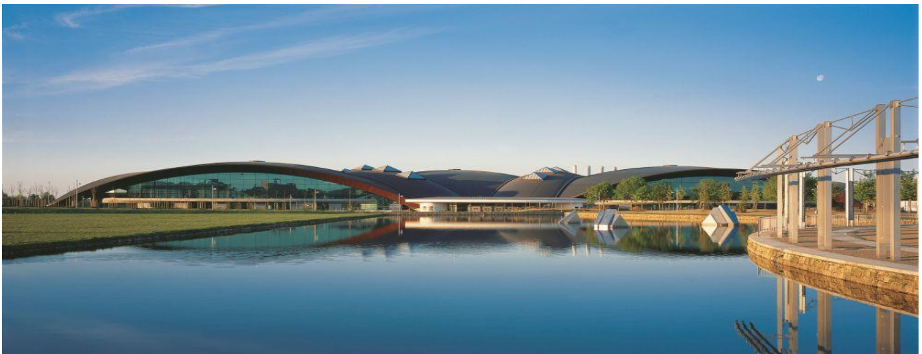
Outside view of d'Coque in Kirchberg

In 1982, first the olympic swimming pool opened its doors. The striking shell-shaped roofline is reminiscent of a seashell, and is made of spans of prestressed concrete. With the swimming pool extension undertaken by architect Roger Taillibert in 2002, the Centre National Sportif et Culturel was created.