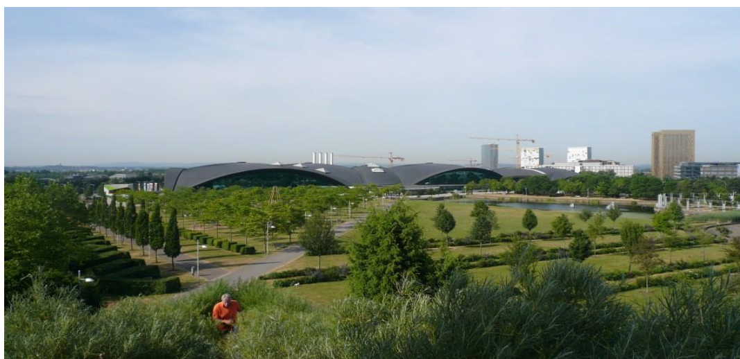
Parc Kirchberg, location of the opening ceremony

Tuesday, August, 3rd: Arrival of the teams, general meeting of IIA and other meetings, opening ceremony, welcome dinner.