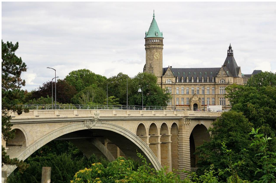
The Adolphe Bridge in Luxembourg City

Luxembourg City is the capital city of the Grand Duchy of Luxembourg (also named "Luxembourg"), and the country's most populous commune. Standing at the confluence of the "Alzette" and "Pétrusse" rivers in southern Luxembourg, the city lies at the heart of Western Europe, situated 213 km by road from Brussels, 372 km from Paris, and 209 km from Cologne. The city contains Luxembourg Castle, established by the Franks in the Early Middle Ages, around which a settlement developed.