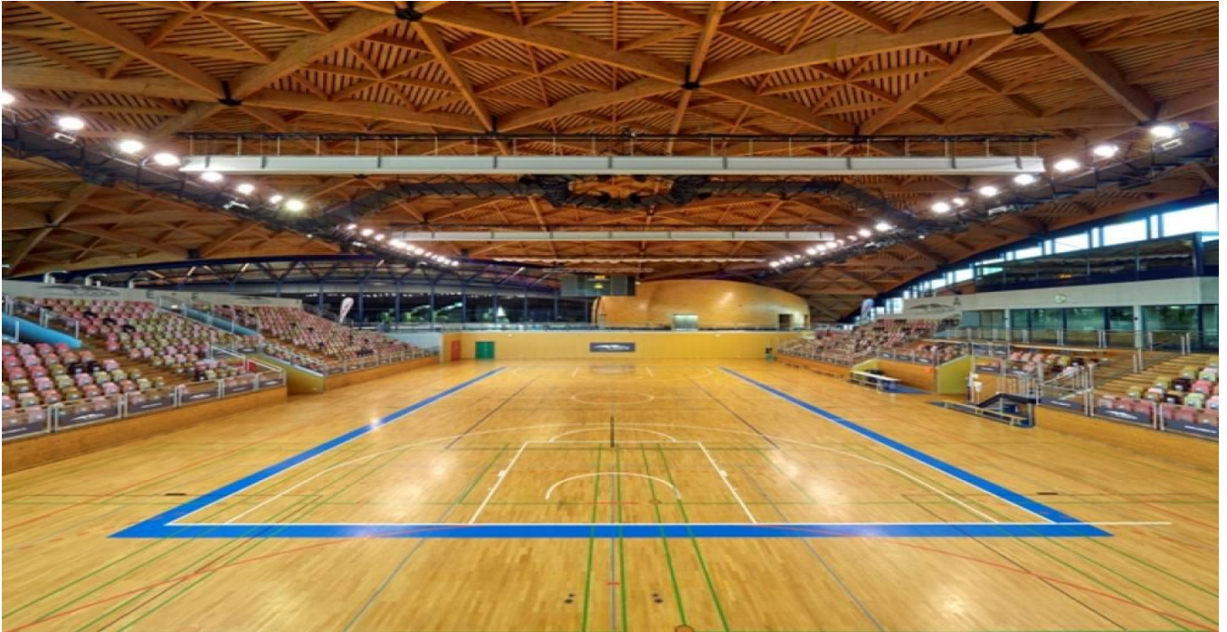
The Gymnase in the Coque

The warm up area is situated in a part of a multi-purpose area of 1.400 square meter which is divisible into three parts.